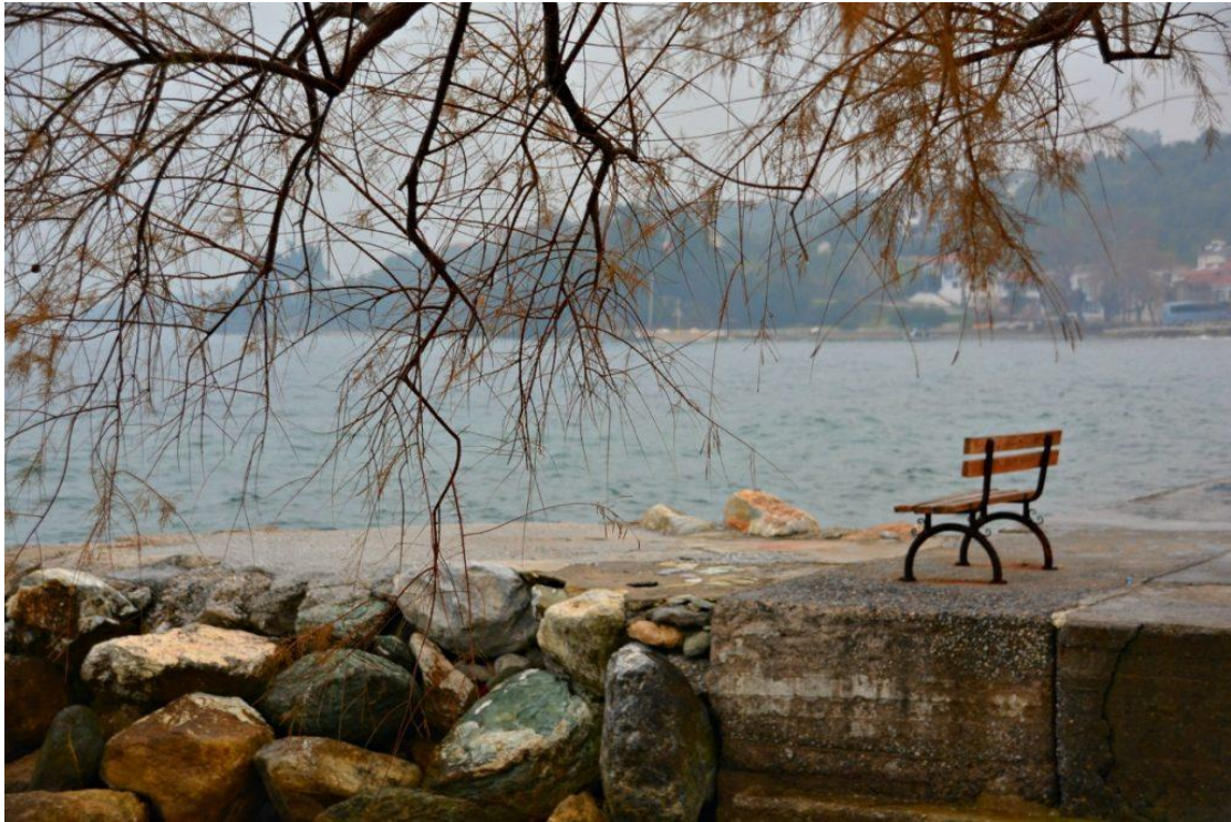
Rainy winter day views in Afissos

The main path in Afissos was another beautiful experience in cold, rainy weather. Set by the Pagasitikos Gulf, you can stroll by the sea and choose from a variety of cafes and tavernas to stop for a relaxing drink or coffee.