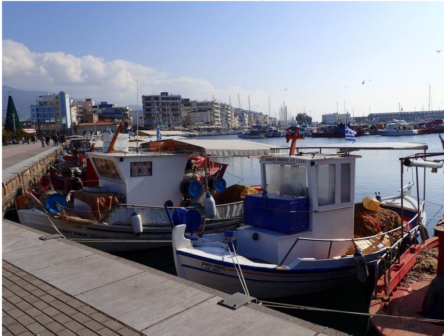
Volos harbor view.

While in Pelion, take time out to spend time in Volos. Located at the foot of Mount Pelion overlooking the Pagasitikos Gulf, it is considered one of the country's most scenic little cities.