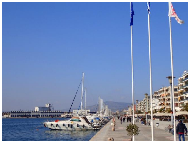
I love Volos.