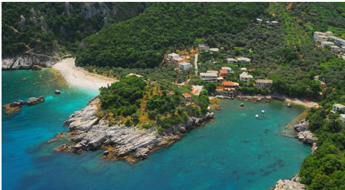
Damouhari Port, Pelion, to the right. Meryl Streep was here!