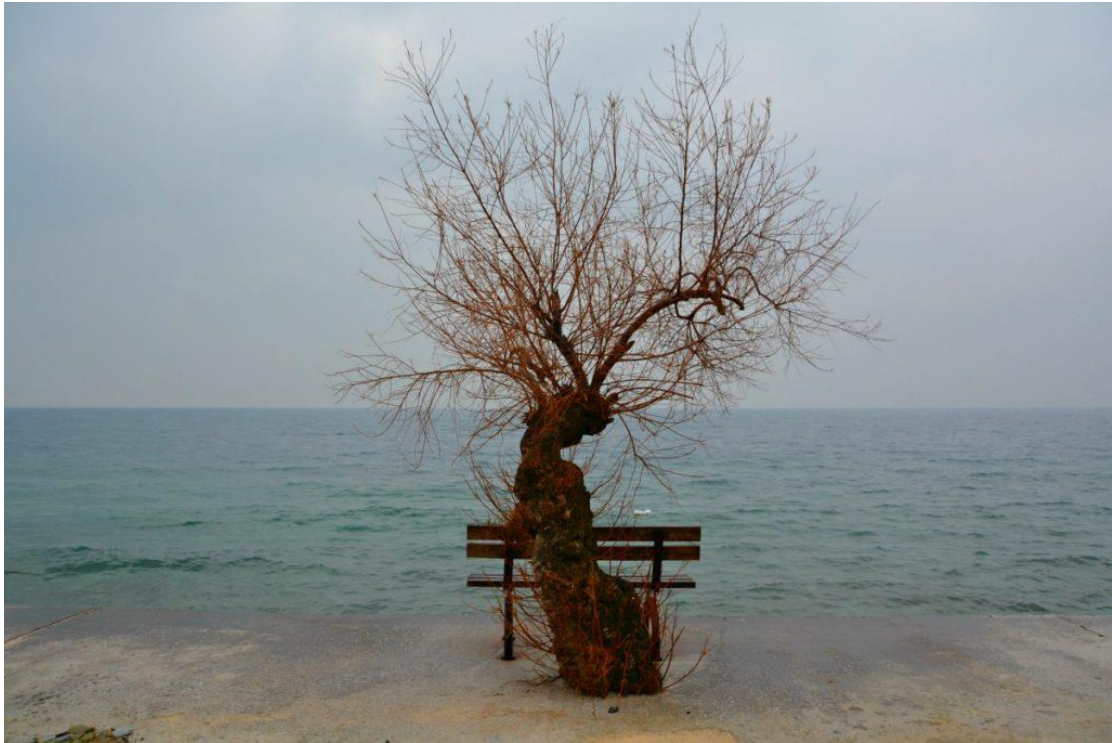
Love the trees in Pelion.

While exploring Pelion, I couldn't help but notice the amazing, old and storied trees that seemed to be everywhere. Gigantic plane trees set the stage in the squares or lined the villages and some truly wise ones overlooked the sea.