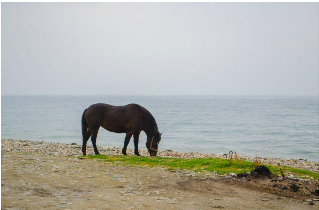
Horse hanging out in Afissos. Photo by Passion for Greece.

With such incredible natural scenery, horse riding is considered one of the top things to do in Pelion. There are several companies throughout the peninsula offering tours and services. One to try is the Riding-Naturalist Club of Milies .