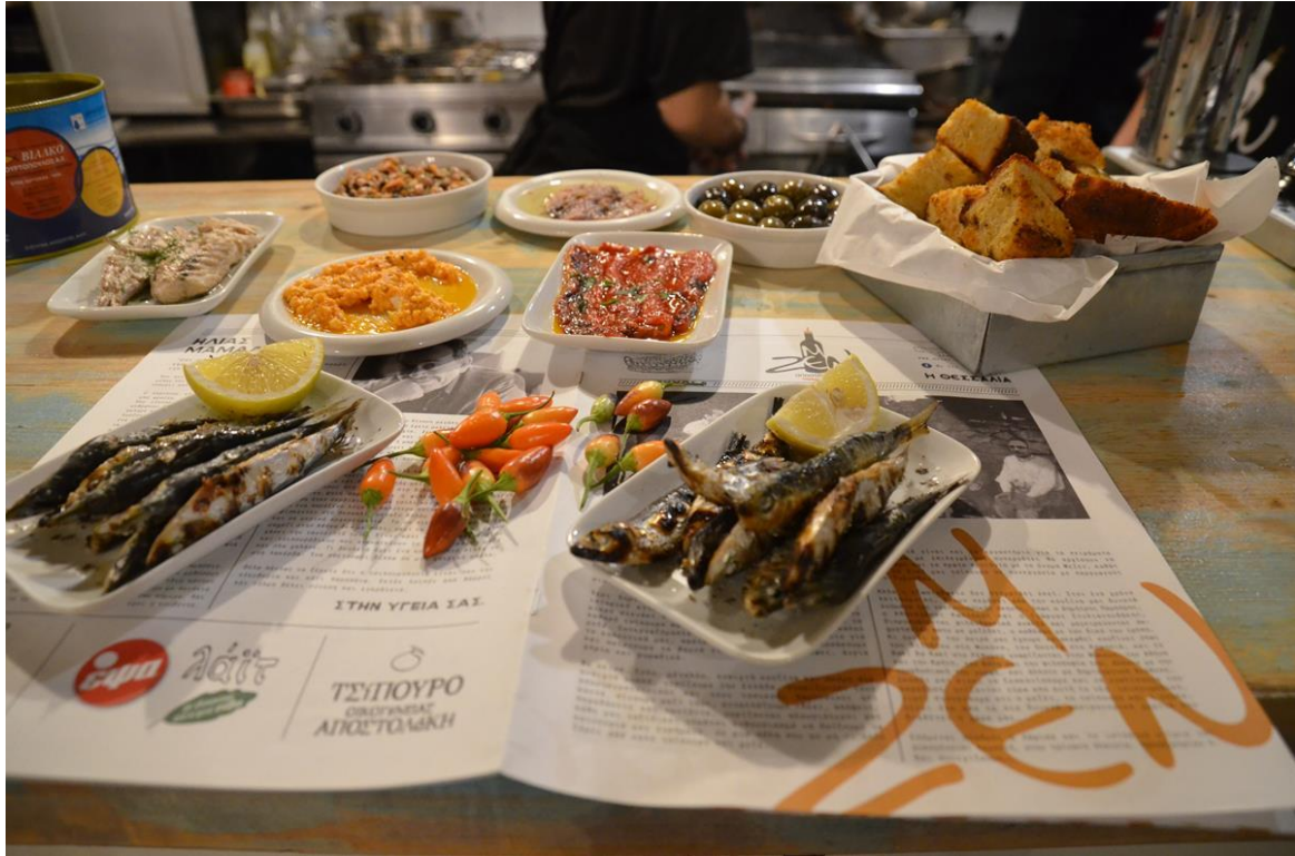
Mezes the Volos way

Tsipouro is meant to be drunken slowly, with good company and tasteful small dishes. I recommend trying tsipouro with mezes at Lepi in Volos .