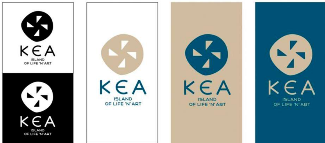
Kea's new visual branding inspired by the island's 4 ancient settlements

This year the municipality of Kea has acquired a new comprehensive visual branding , designed by the Karlopoulos & Associates based on symbols found on coins from ancient Tetrapolis – the name of the island in antiquity which derives from the four cities that once flourished here: Korissos, Ioulis, Poiessa and Karthea .