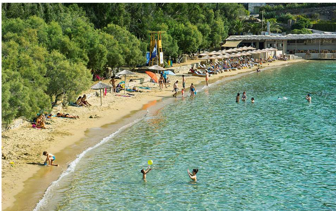
The beach at Yialiskari