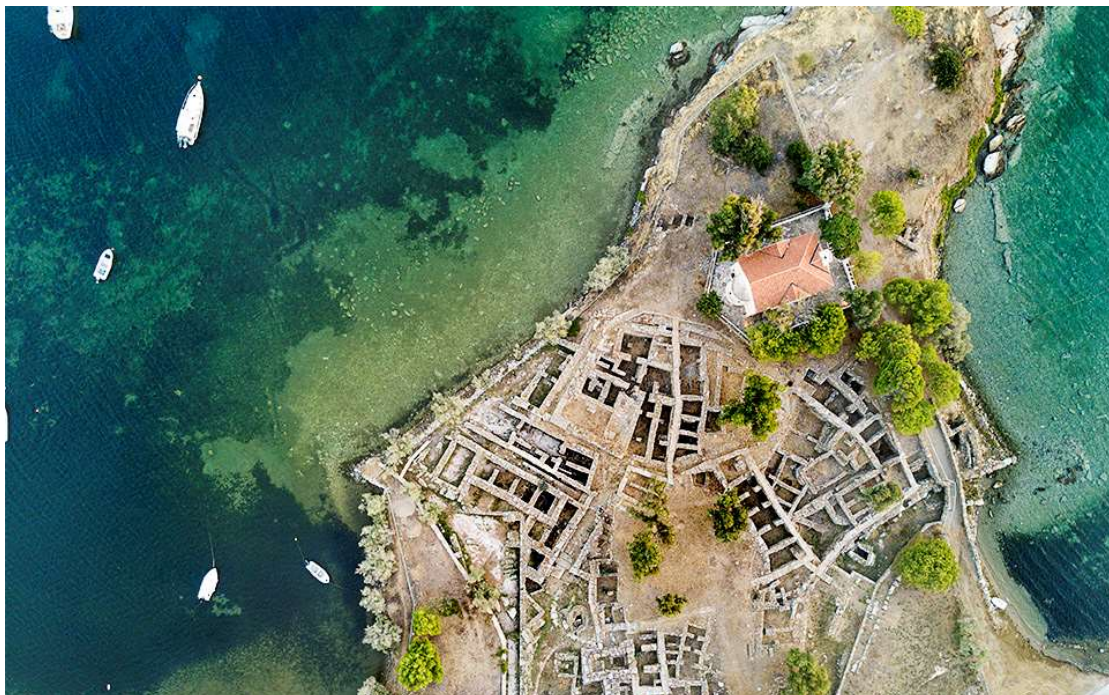
The remains of an ancient settlement in Aghia Eirini

In 2012 she also launched the Acorn Initiative which seeks make use of the acorn caps produced on the island by exporting them for use in the tanning industry. This summer arrived to find Kea quietly rejuvenated – and ourselves enjoying the hospitality of Porto Kea Suites in Korissia , dining on the exceptional dishes of its restaurant and lulled to sleep by the sound of the sea.