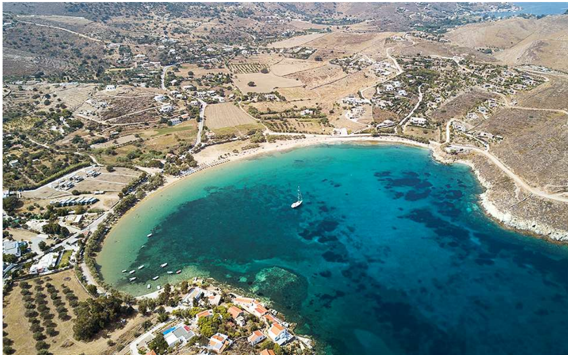
The bay of Otzias

Overall, the island has managed to maintain a remarkable sense of balance . On the one hand it remains closely connected to nature (roughly 60% of the island's forests are protected as part of the Natura network) and the traditional practice of raising livestock remains an important economic activity. Yet at the same time it is developing a sophisticated form of tourism, maintaining a discreet cosmopolitanism.