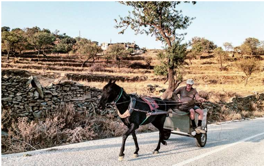
Returning from work, close to the village of Ellinika

From the cross-roads above Ioulida take the road for the beaches on the eastern coast: Spathi, Kalidonihi and Sikamia , with Psathi and Orko further south. All of them are exceptional and will make you forget that you are only an hour away from the port of Lavrion .