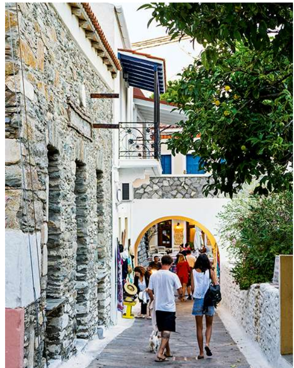
The ancient stone lion of Kea / Walking on the streets of Ioulida