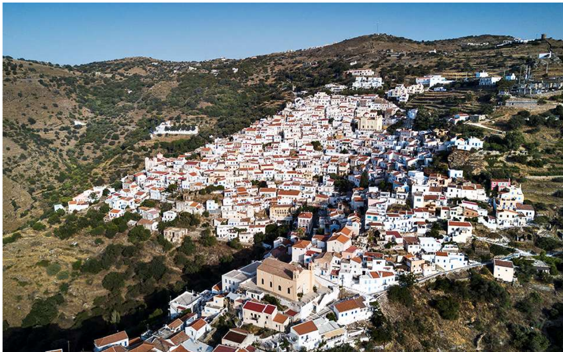
The village of Ioulida is the island's capital and one of the prettiest in the Cyclades

On the opposite side of the bay of Vourkari, in Aghia Eirini , one can see a prehistoric settlement and the ruins of a temple and fortifications that date to the middle of the Bronze Age (2,000 – 1,600 BC), evidence of Kea’s deep history. Otzias , the island’s northernmost bay , features an organized beach which gets quite busy with families and groups when the wind is not too strong. The more adventurous may continue on to the Monastery of Panagia Kastriani and from there to Ioulida.