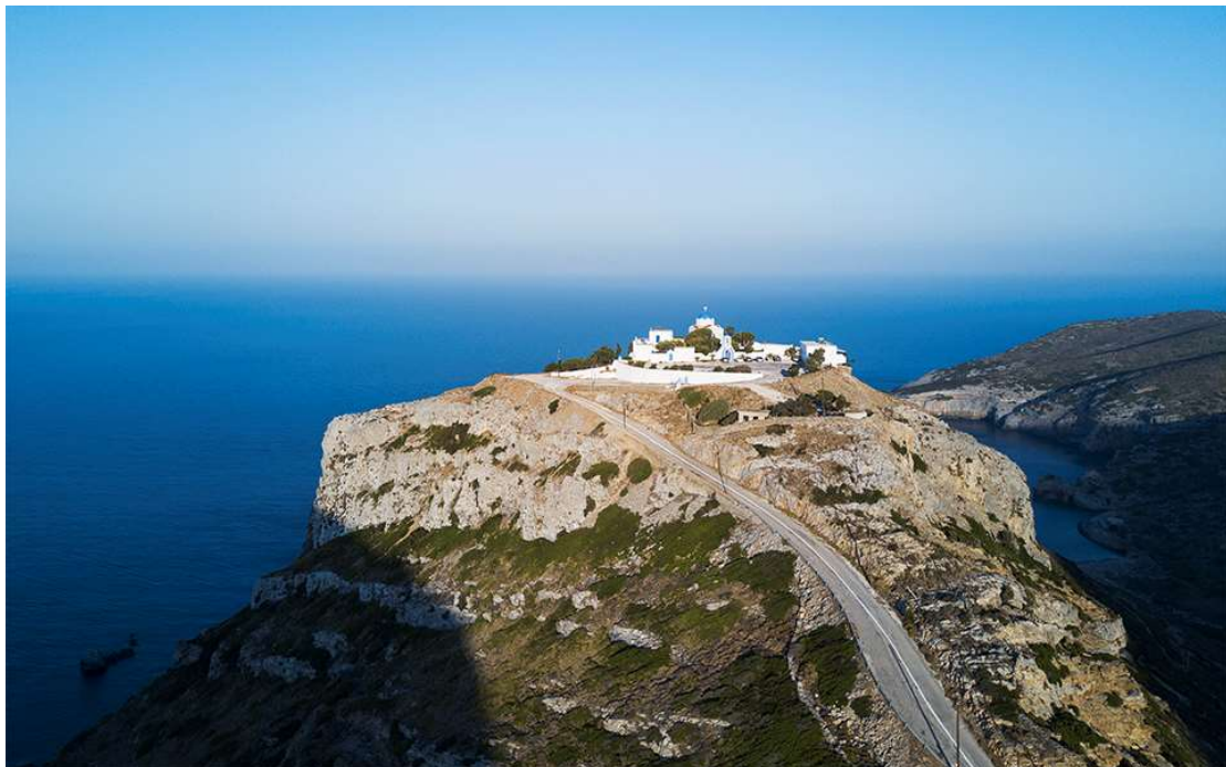
The Kastriani Monastery