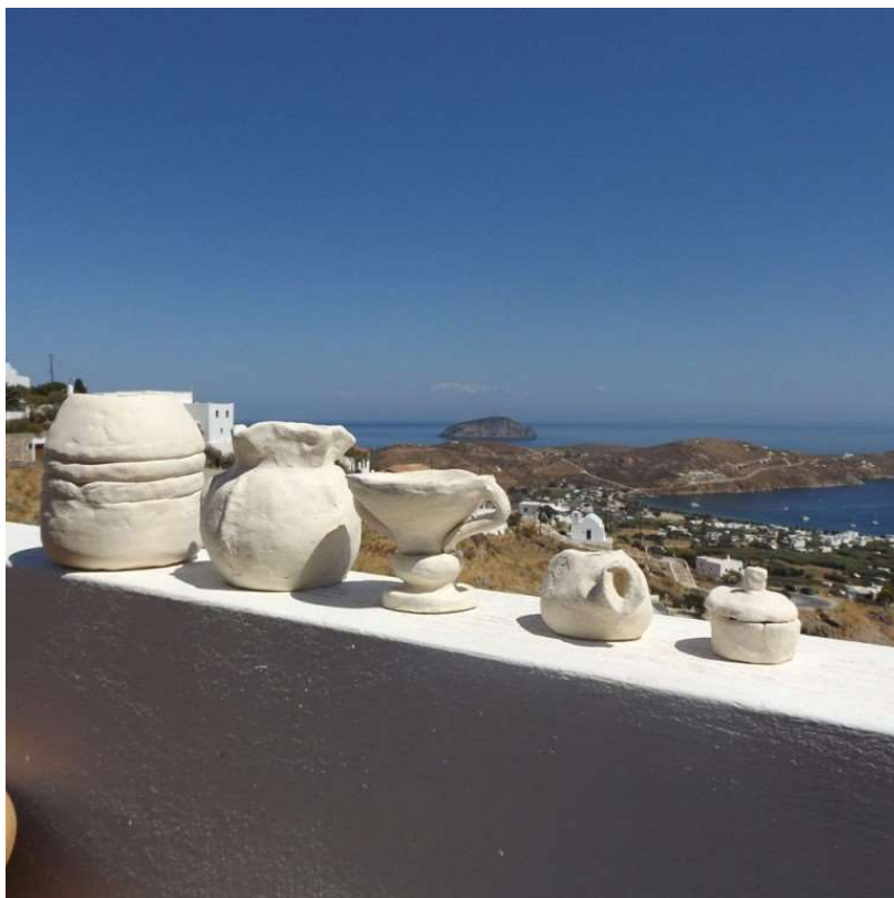
Have fun with clay

Kerameio Ceramic Studio. +30 2281 051880