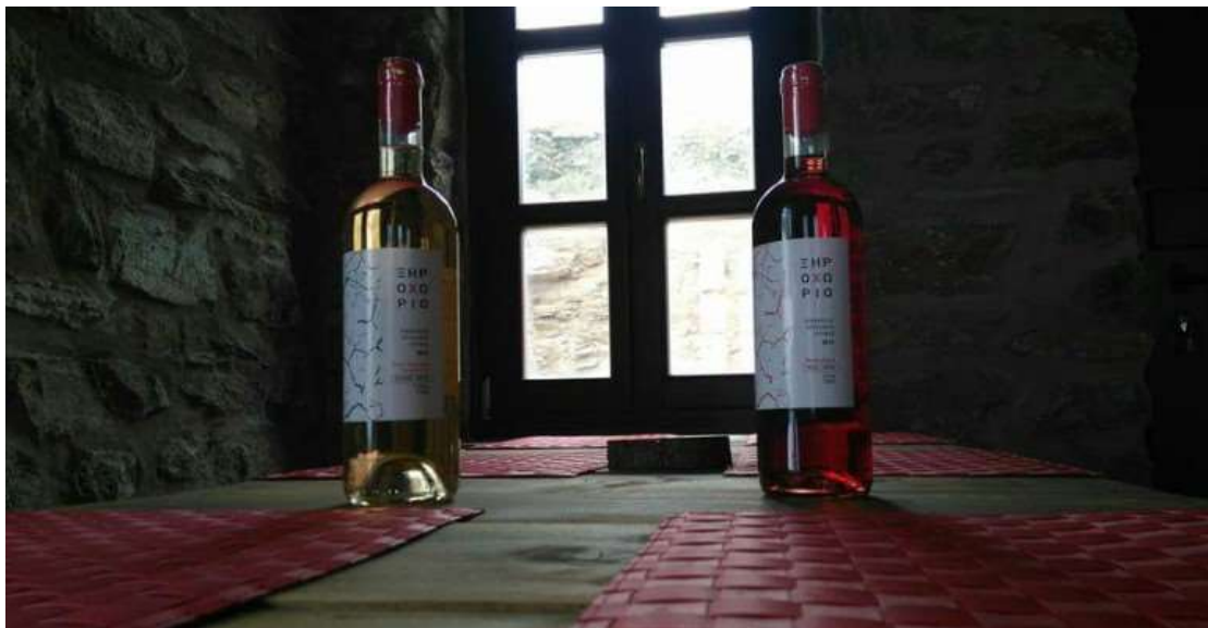
Red or white? t's your choice