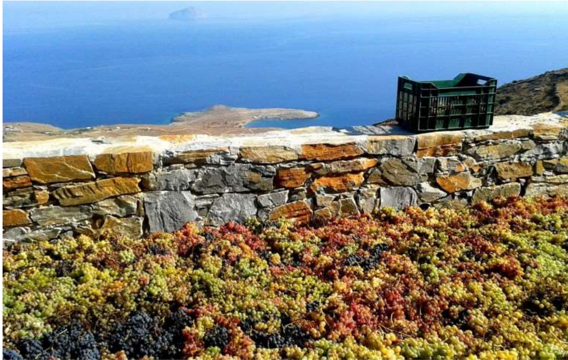
Enjoy local wines at Chrysoloras Winery

After a visit to the Taxiarchon Monastery, drop by the Chrysoloras winery , where owner and winemaker Christos Chrysoloras makes bio certified wine with local grape variety such called Serfiotiko , which produces a unique white wine. Chrysoloras also works with other varieties such as Monemvasia and Aidani.