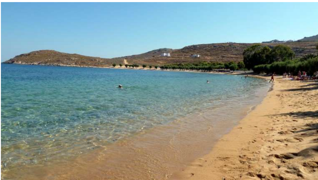
Livadaki beach

With a whopping 72 beaches, Serifos is one of the best place to spend a day or two (or three) for a bit of beach relaxing. With everything from sandy to pebbly beaches bordered by turquoise waters, you will easily find your own perfect beach for soaking up some vitamin D. Psili Ammos, Agios Sostis or Livadaki beaches are all perfect for a beach day. What more could you ask for?