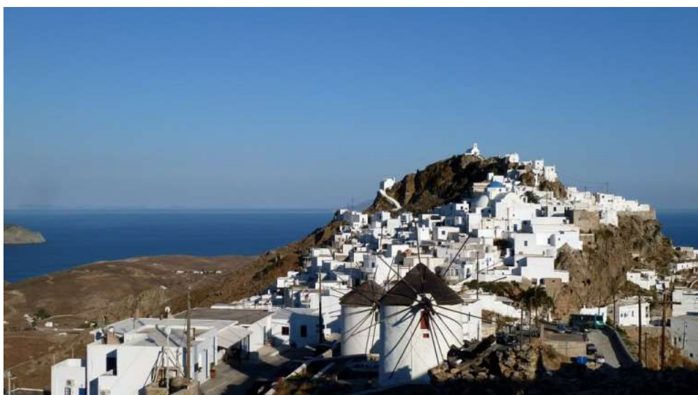
View of Hora of Serifos

Perched on a hill 5km (3 mi.) away from Livadi Harbor , Hora, the capital of Serifos, will quickly seduce you. Its white-washed houses, various churches and windmills, narrow streets and scenic location make it a charming place for leisurely strolls. You can even discover the ruins of a Venetian castle, as well as quaint museums.