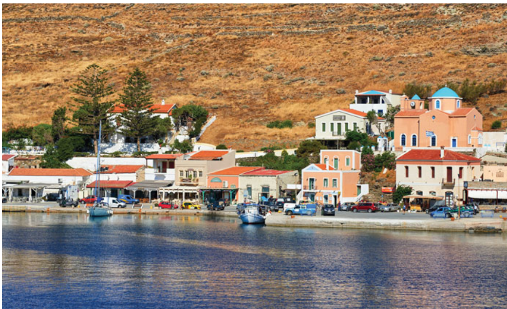
The church of Agia Triada is the trademark of the harbor.