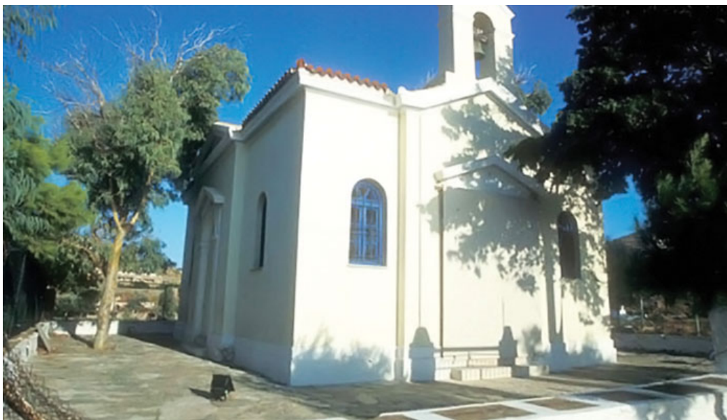
Agia Irini peninsular, took its name by the small church of the same name that is located here.